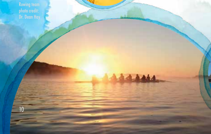
Rowing team